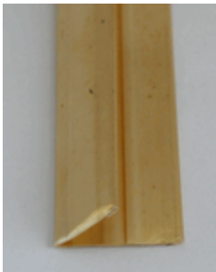
V-shaped Spring Bronze Weather-strip 3/4 Inch